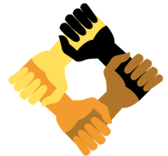
Community & Belonging